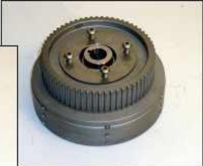
Housing retainer being installed