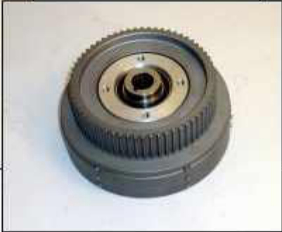
Backside of basket