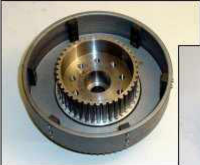
Hub installed in basket

We supply 9 shoulder bolts and coil springs, a stock application may only need to use 6 shoulder bolts and coil springs for the amount of pressure you like or want for your application. Install adjustment screw and adjust clutch per Harley specs. Lock down jam nut when desired clutch adjustment has been achieved.